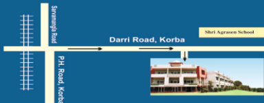
Location Plan of Shri Agrasen Girls College, Korba